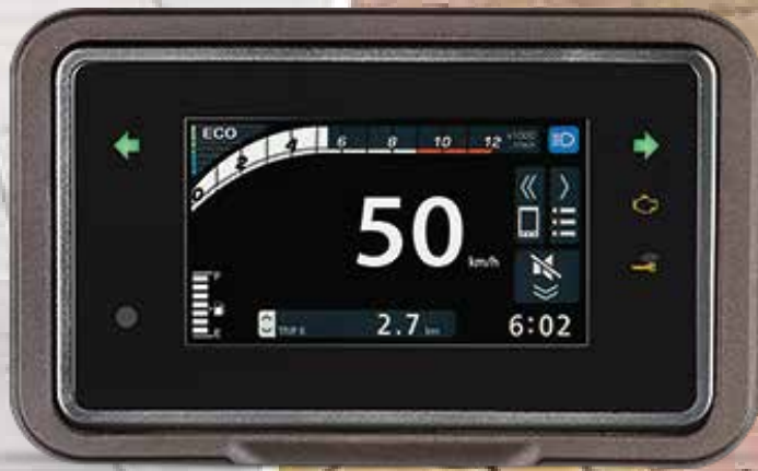
All New ACTIVA 125