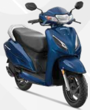
Decent Blue Metallic